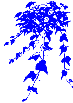
Baltic or English Ivy

Barrenwort ( Epimedium varieties) 30 cm tall, spacing 30 cm. Also known as ÷ Bishop's Hat due to its unique flower shape. Fresh green