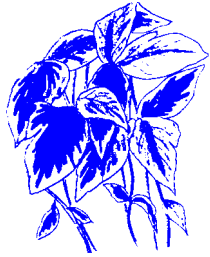
Goutweed, or Bishop's-weed*

Goutweed ( Aegopodium podagraria ÷ Variegatum ) 45 cm tall, spacing 30 cm. Also called Ground Elder. Bright green and white foliage. Sun or shade.