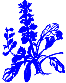
Ajuga, or Bugleweed